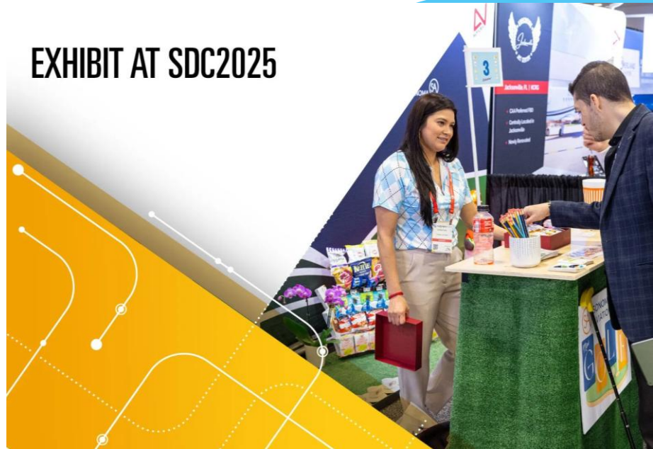
EXHIBIT AT SDC2025